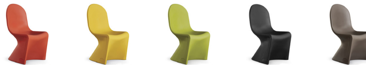
BLAZE ORANGE VEGAS YELLOW LIME GREEN BLACK THUNDER GREY