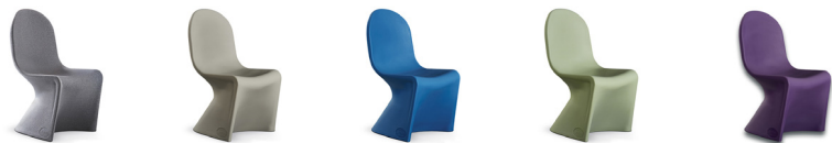
GRANITE MOONWALK GREY EPIC BLUE COOL GREEN ICON PURPLE